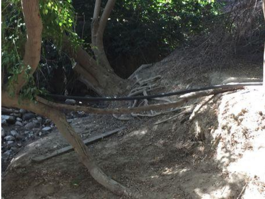
Log Entry Photo C